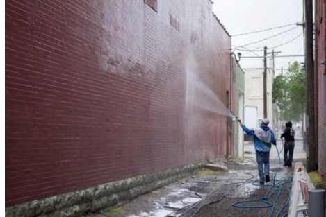
Integrity Soft Wash prepped the wall for the mural FREE OF CHARGE! Prepping the wall with a low pressure system allows for the mural paint to adhere nicely!