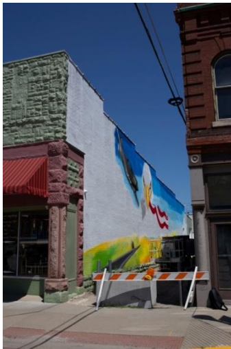
By the end of July the eagle head and B-2 bomber were visible.