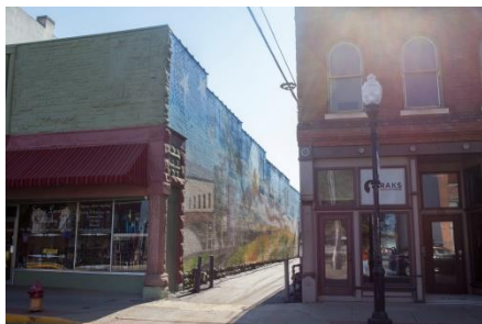
The finished product!! Stop by and see it in person!