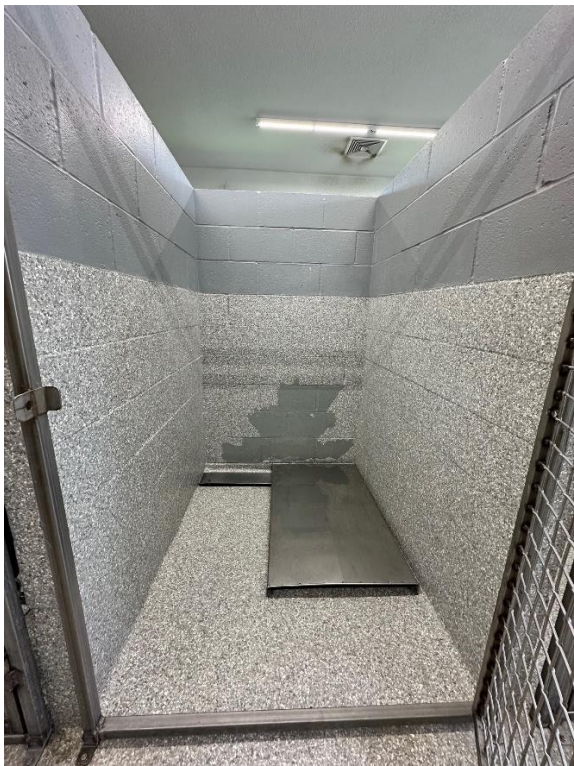
Kennel Pictures Exhibit A