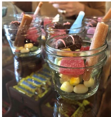
Jar-cuteries filled with candy!