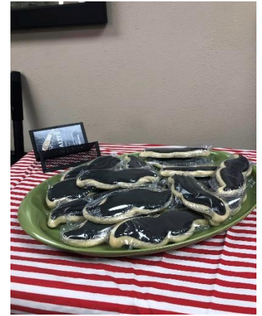
We "moust-ache" you a question... aren't these the cutest moustache cookies ever?