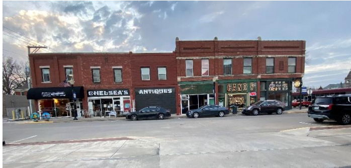
Lolly's Candy Shop at 702 S. Ohio Avenue is one of our sweetest additions to Downtown Sedalia!

Thank You... Lolly's Candy Shop for being our first business to host our Downtown Connect social on February 15, 2023! We all had a great time getting to learn more about your store plus we got to explore Rialti's Barber Shop – our first business to utilizing an alley entrance.